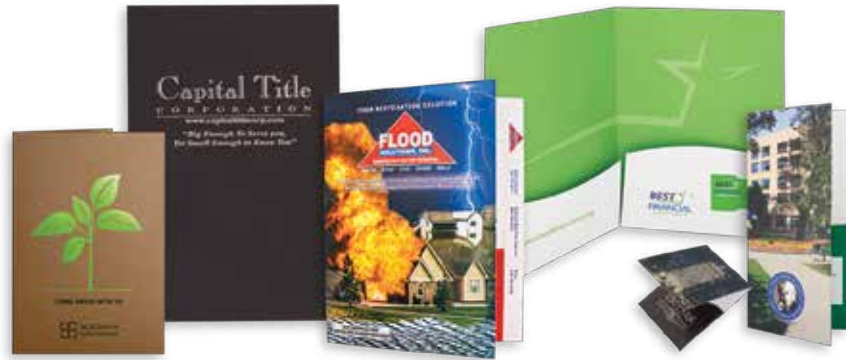
Image is everything! It is vital that your handouts, reports and other marketing materials are packaged with a look that captures the attention of your audience and allows your hard work to be recognized.